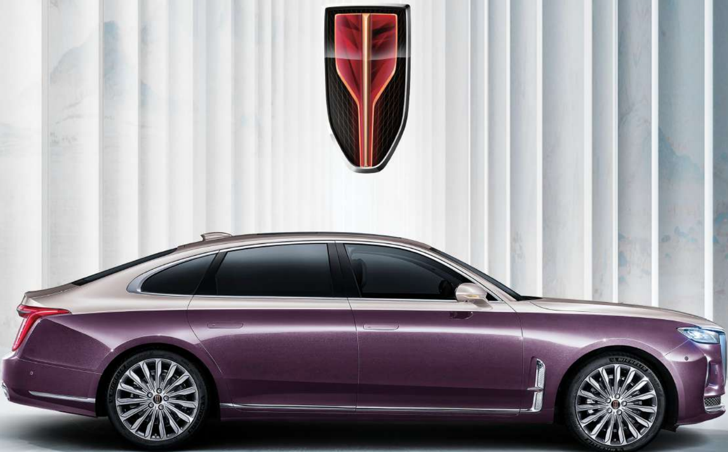
20 wheel rims 245/40 R20